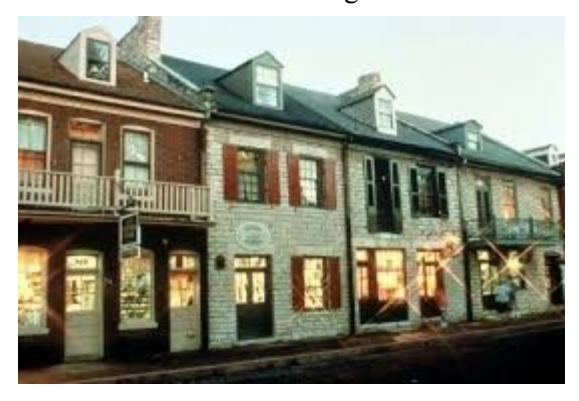
Discover Historic St. Charles

Wednesday-Thursday, September 25-26, 2019