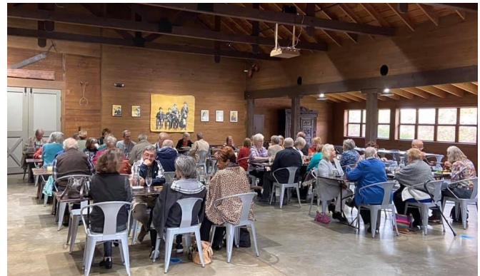
LIR members enjoy lunch at Tin Mill Restaurant and Brewery in Hermann, Missouri, while on a tour of stained glass windows in area churches.