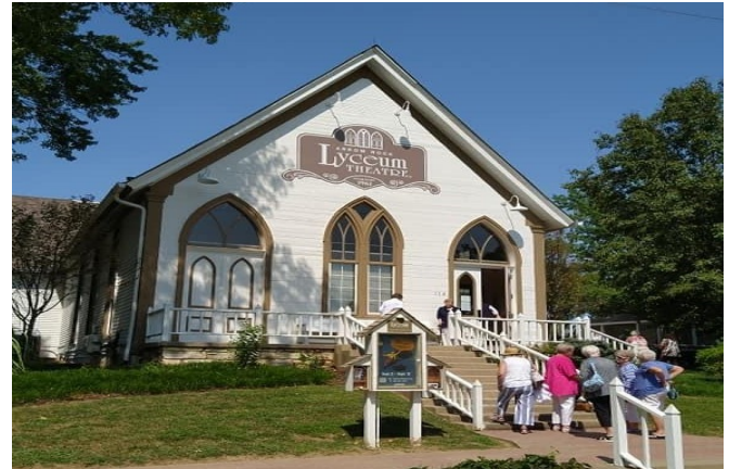
LIR members approach the entrance to Lyceum Theater at Arrowrock on one of the many LIR trips.

You never know where you may find LIR members or what they will be doing. Below are pictures from the last few months.