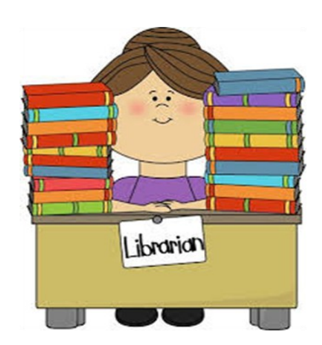
Libraries — Past, Present, and Future

Dates: Thursdays, April 7, 14, 21, 28, 2016