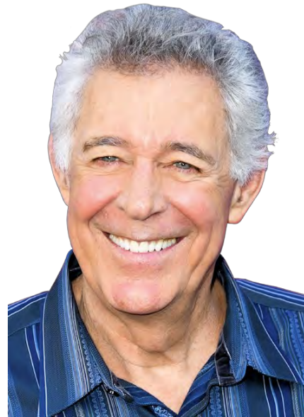
Brady Bunch star Barry Williams

Come join us as we travel to the New Theatre in Overland Park to see the American premiere of Condo-monium. On the way, we'll stop at McDonald's in Sedalia for a comfort/food stop. When this show premiered in London, The London Times said it's a "fast-paced, five-star, tremendously fun comedy that will have you laughing from the moment the curtain goes up." The New Theatre was the first in America to snap it up—and then they cast Barry Williams of The Brady Bunch. It's a good, old-fashioned farce that you're sure to enjoy.