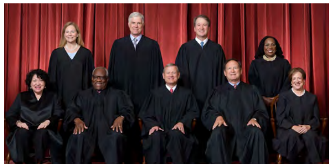
Supreme Court members, left to right. Front row: Sonia Sotomayor, Clarence Thomas, John Roberts, Samuel Alito, and Elena Kagan. Back row: Amy Coney Barrett, Neil Gorsuch, Brett Kavanaugh, and Ketanji Brown Jackson