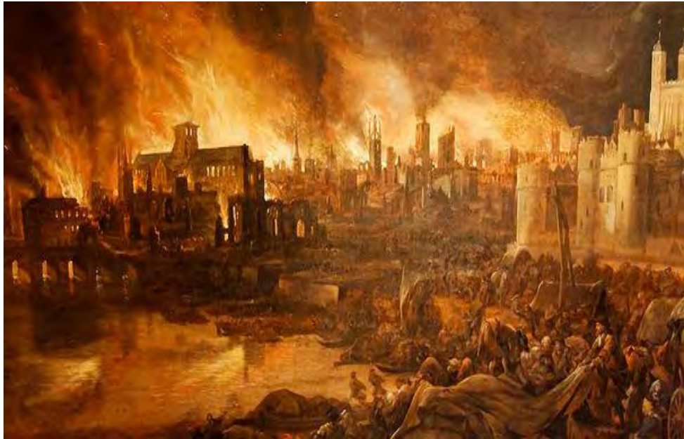
Great Fire of Rome