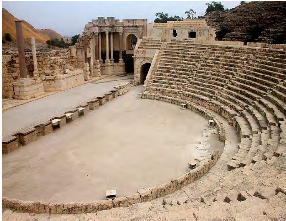
Roman Theatre at Beit She'an